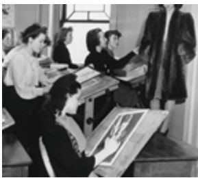
SFD classrooms circa 1930s